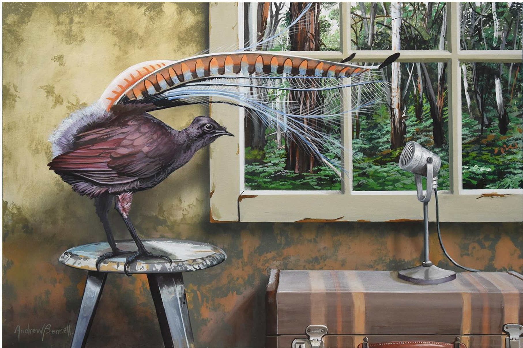
LYRE'S COUNTRY BROADCAST 60 x 90cm acrylic on canvas $ 4,700.00

"A Lyre bird stands on an ancient stool facing an old-style broadcast micro phone with a window showing its possible rain forest home in the background. Has it come into the studio for a weekly country broadcast? For whom and why.