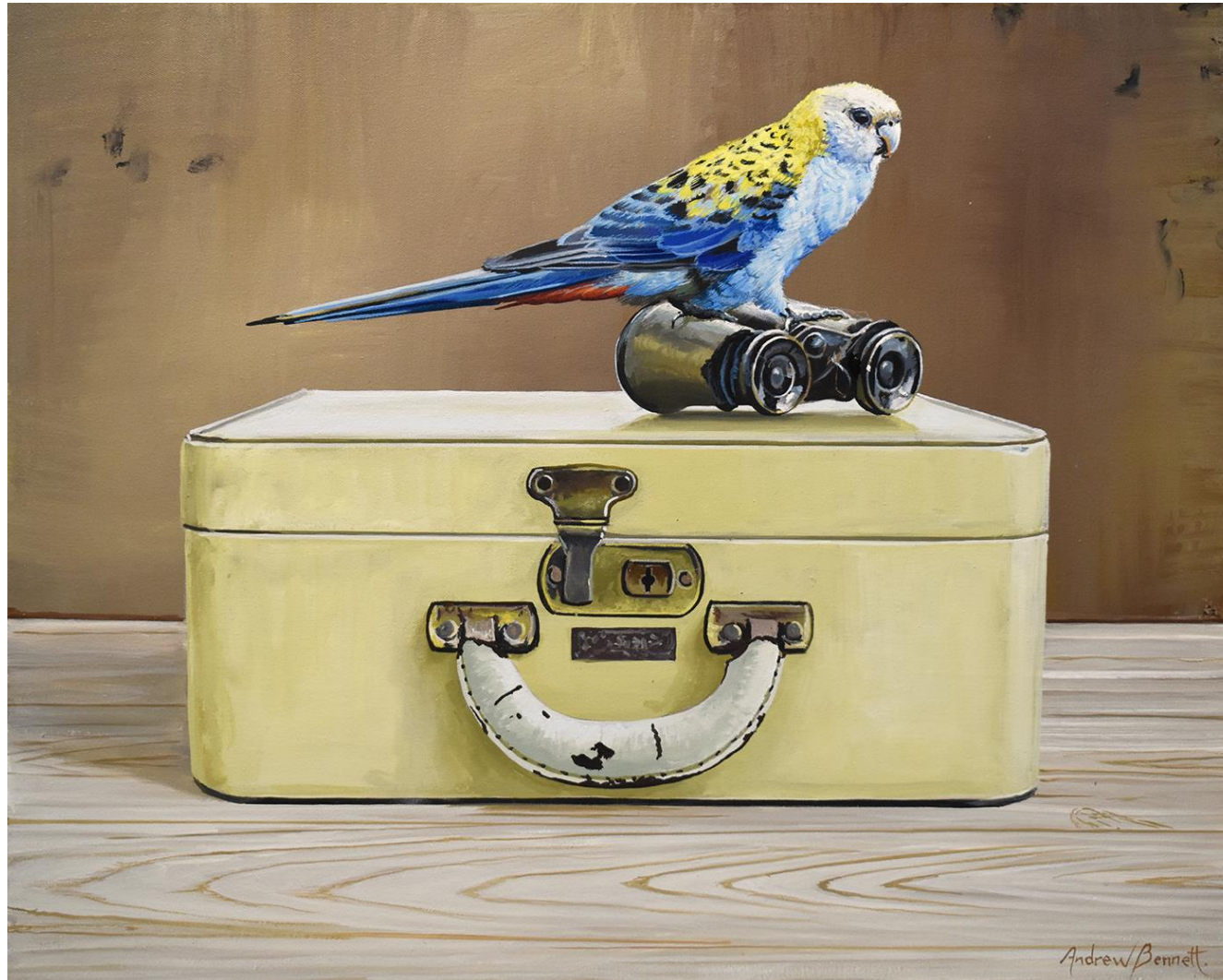
A PALE HEAD'S VIEW 61 x 76 cm acrylic on canvas $ 4,000.00

A rare Pale Headed. Rosella makes a showing onto of a set of twitcher binoculars sitting on a small weekend getaway suitcase. Is it being cheeky?