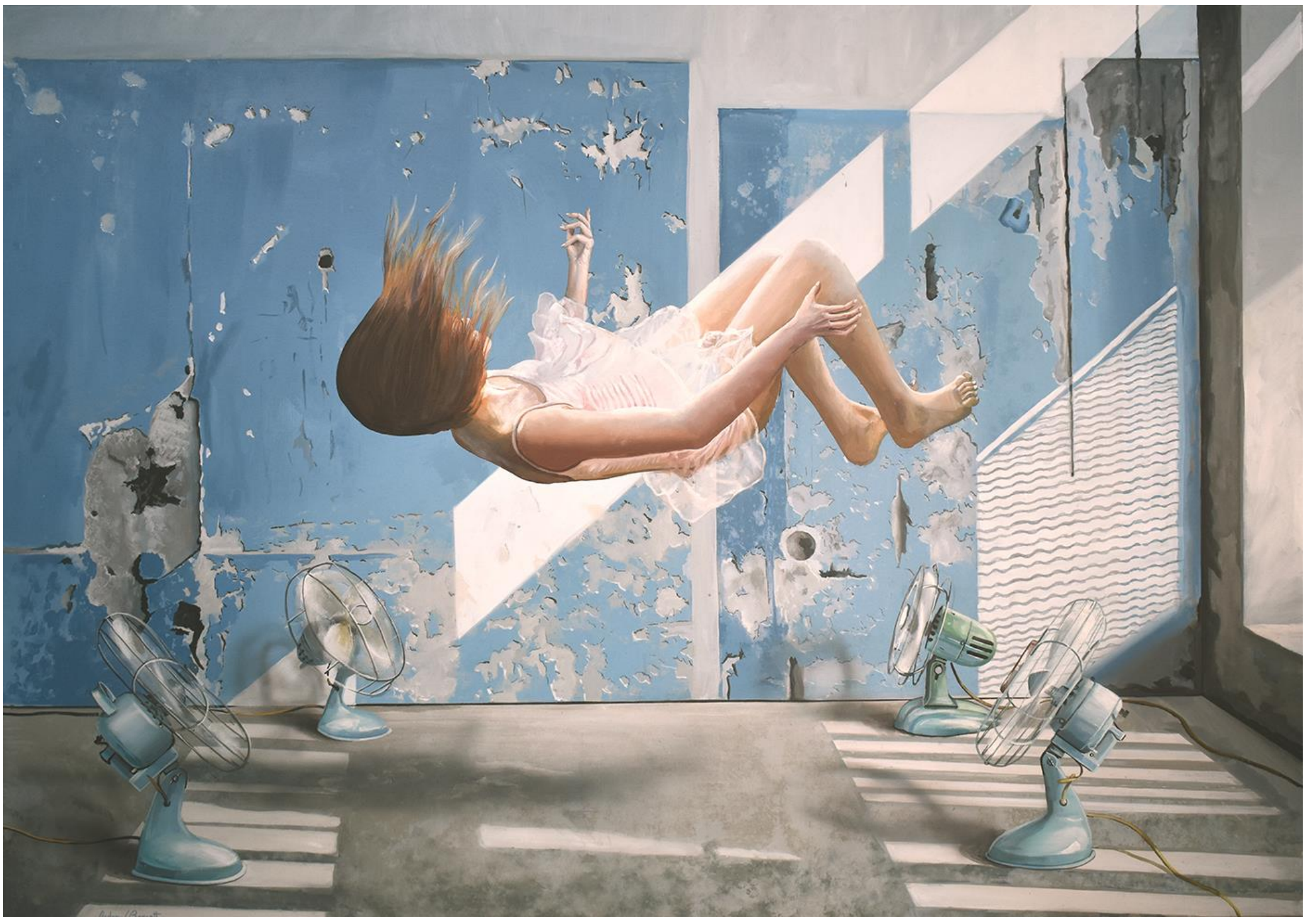
FANNING THAT FLOATING FEELING 130 x 180cm acrylic on canvas $ 19,000.00