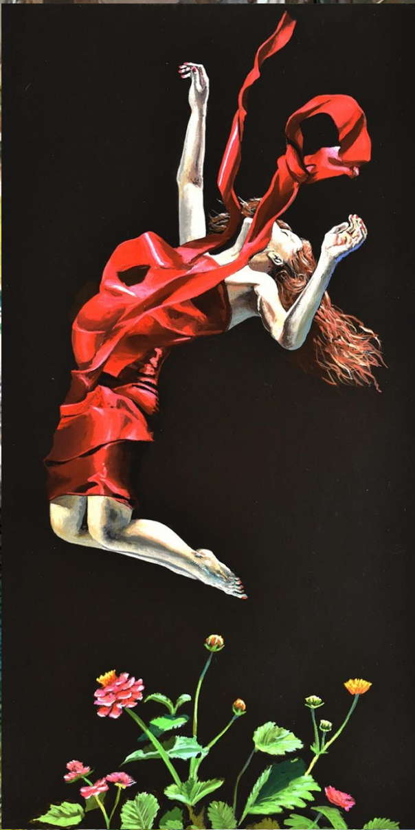
RED RIBBON JOY