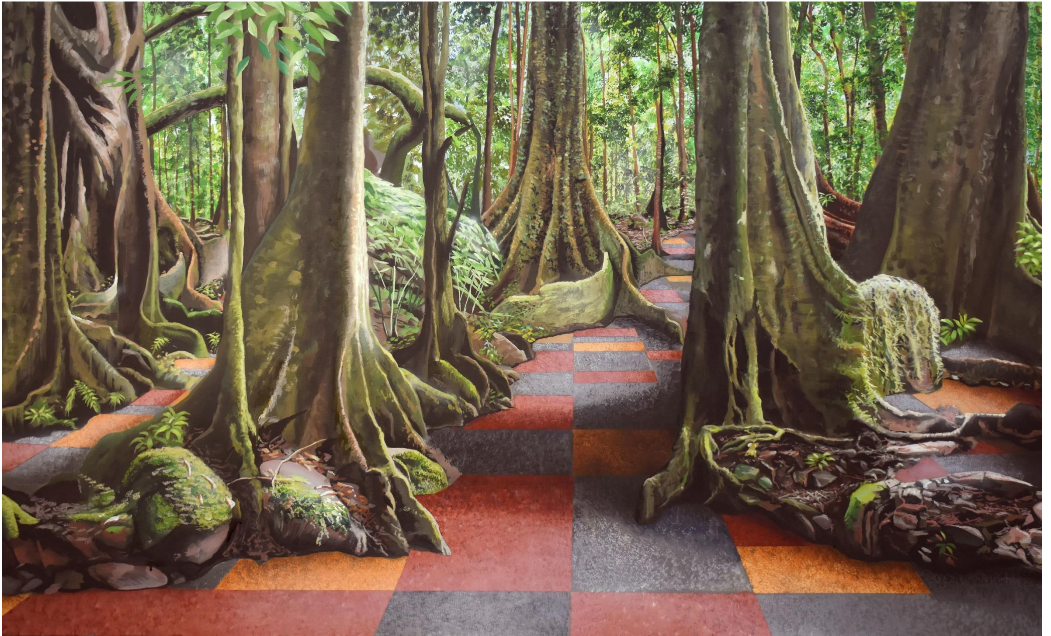
SLOW WALK, AN INTRUSION INTO THE RAINFOREST 110 x 180 cm acrylic on canvas $ 16,000.00